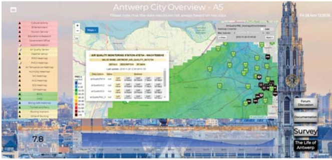
Fig. 1. A Dashboard Example